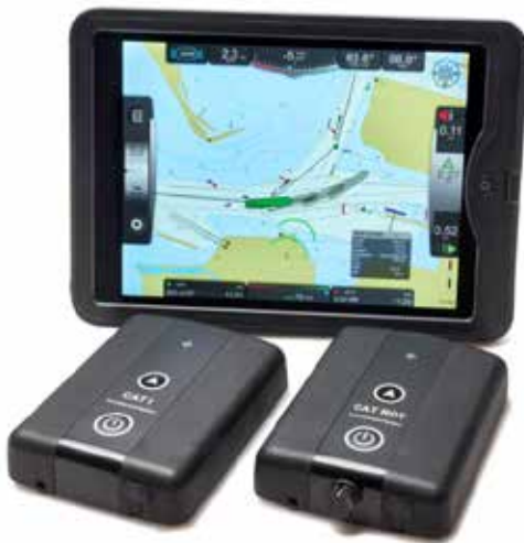
Example compatible device/software: SafePilot-Trelleborg Marine Systems

The ENC Writer extension was developed in collaboration with our Licenced Partner and S-57 expert, Geomod.