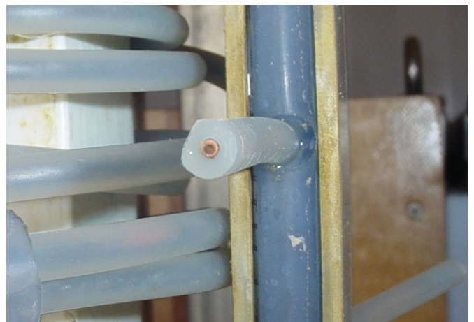
Electrode tip after three years of operation

Zero tip wear is essential for the repeatability of the acoustic pulse, which depends largely on a constant, unaltered electrode surface.